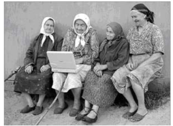
This is how Babushki dress when it is warm, so perhaps you can imagine cold weather.

Well, proper cold-weather dressing and a knowledge of golden-age Spanish literature I suppose are two things I might never get paid for but might look for every opportunity to cash in on. Wish me luck!