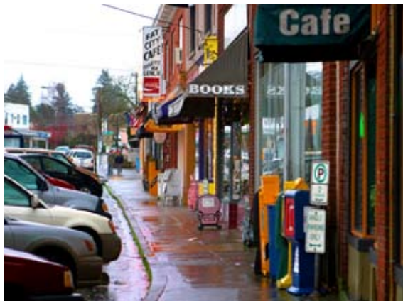
Hippy Portland. Why am I wired to like it?

Because here, for whatever reason, we can kind of get away with shorts and sandals and a jacket even when it’s cold. Sometimes someone puts on a sweater or wears pants. My husband, for instance, wears his sandals even to walk in subzero temps, mostly because his sandals are comfortable. He never wears a sweater. Or a turtleneck or a hat or a scarf or anything like that.