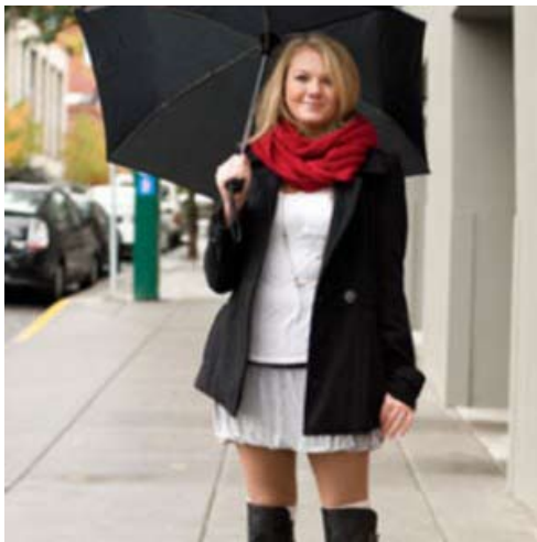
This is what Portland people think is cold weather—notice, no snow, her jacket is unbuttoned, and gloves? hat? Hello? This is not cold.

And here is the Russian Babushka part. If you see a person who is dressed inappropriately for the weather, that is a basis on which to judge them to be foolish. But here in Oregon, people just don't get it, they don't care. So, by the measuring stick of a Russian Babushka, every Oregonian is a fool.